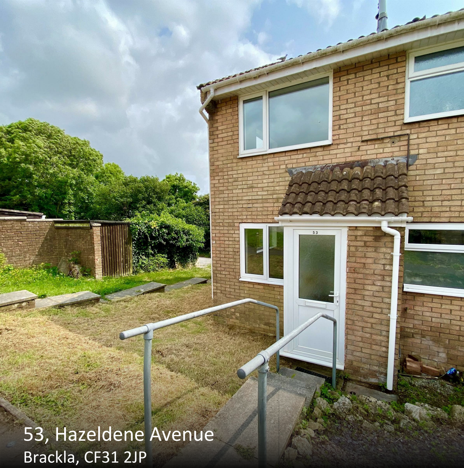
53, Hazeldene Avenue Brackla, CF31 2JP